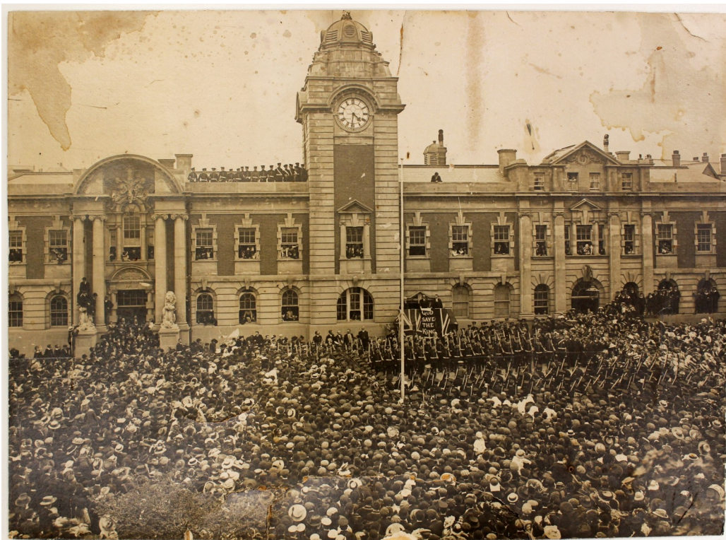
Tudalen 8 2

The mission of the service is to safeguard and develop the collections, whilst also making them as widely accessible as possible in order to engage, educate and empower all those who come into contact with them, now and in the future. The service will take a proactive and inclusive approach to enhancing the collection and its access by addressing cataloguing and conservation backlogs, developing a comprehensive solution for digital preservation and embracing new and innovative approaches for engagement and access to the collections in an increasingly digital world.